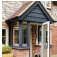
Doors and Porches